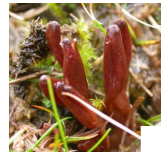
Earth tongues Geoglossaceae species

Say "aahh..." These fungi are aptly named, appearing like the tongue of some hidden beast lying beneath the earth.