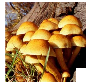
Sulphur Tuft Hypholoma fasciculare

This brimstone-hued toadstool grows in such crowded clumps that their caps often squash into each other.