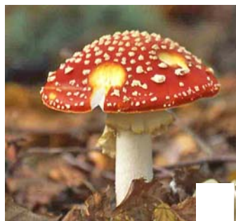
Fly Agaric Amanita muscaria

Where to find it: Various types of woodland.