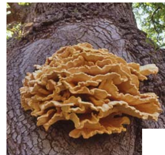
Chicken-of-the-Woods Laetiporus sulphureus

Where to find it: Parks & grassy places.