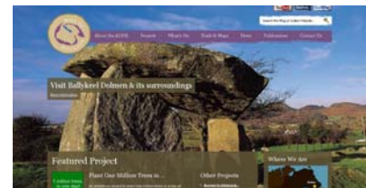
Ring of Gullion Homepage

The website was launched in June this year and has seen over 1200 visits so far. Check out www.ringofgullion.org for more information on all the events in 2012, progress on projects and lots more. You can download lots of publications including the full Ring of Gullion Management Plan from the publications pages. There are also books about geology and fishing on there too. And if you're signed up to Facebook and Twitter, you can follow us there and get updates on what's happening in the Ring of Gullion, so you'll never miss an event again!