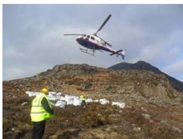
Slieve Binnian Footpath Project